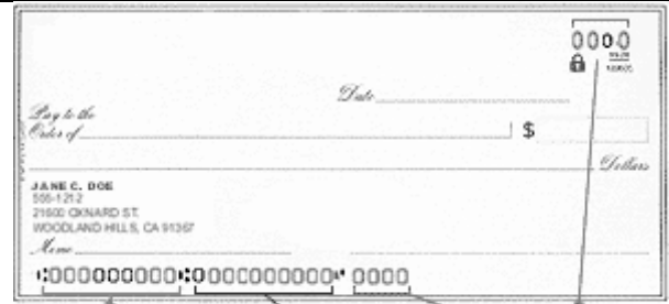
Routing Number Account Number Check Number

No , I do not want to use Easy Pay. Please bill me each month.